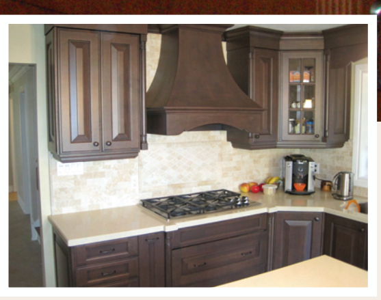
See page 80 for Before and After photos with client comments